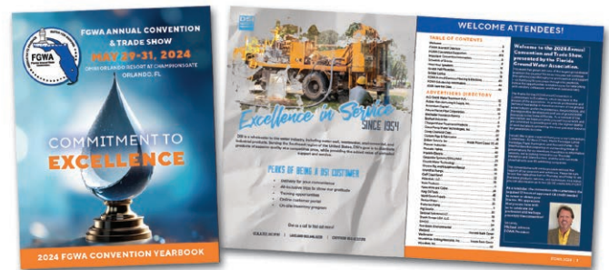
2024 FGWA Convention Yearbook

If you are interested in showing your support of the FGWA and advertising your company and its products at the same time, please return your exhibitor agreement today. Advertisers will be contacted by FGWA regarding specifications and deadlines once the agreement has been received. Please note that the FGWA Convention Yearbook will be printed in full color, all ads submitted must be in full color. No black & white ads will be accepted.