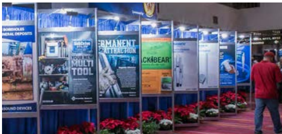
Exhibit Hall Aisle Standing Sign - 1,000 (6 available)

Feature your company in a prominent way!